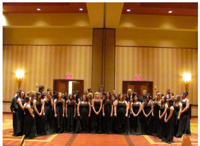
The LaVergne High School Choraliars (Rutherford Co.), performing at the Saturday luncheon.